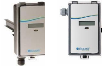
eSENSE™ Duct Disp eSENSE™ Ind Disp Dim: 142 x 84 x 46 mm