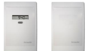
eSENSE™ II Disp eSENSE™ II Dim: 130 x 85 x 30 mm