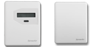
eSENSE™ Disp eSENSE™ Dim: 100 x 80 x 28 mm