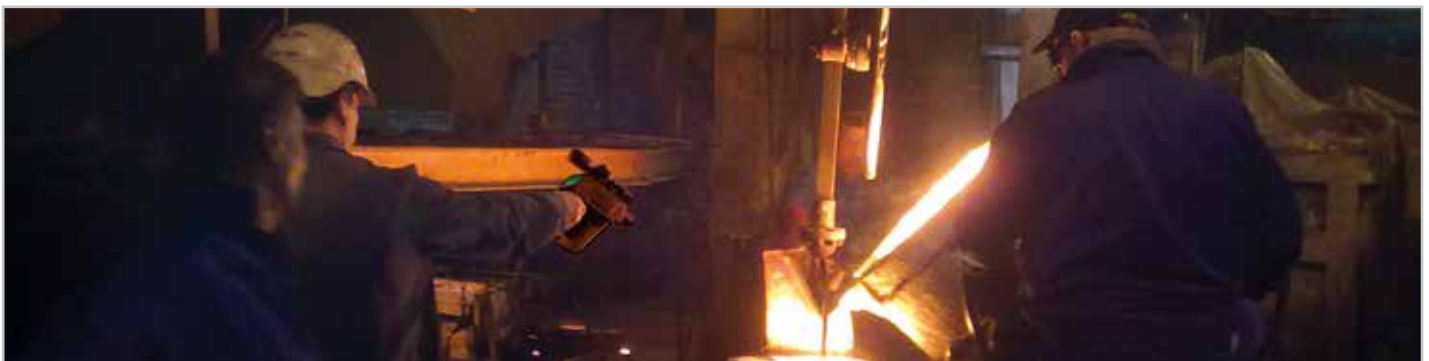
Non-contact temperature measurement from a safe distance