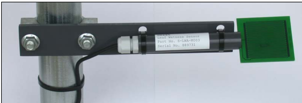
Figure 1: Typical Mounting of the Leaf Wetness Smart Sensor