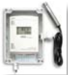
Protective Case for LCD Logger U14-CASE-4x 1.7 x 12.7 x 5.7 cm (6.75 x 2.25 in) 315.2 g (11.2 oz)