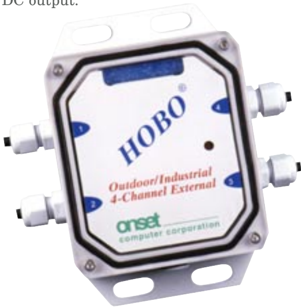
Size: 140 x 137 x 32 mm (5.50 x 5.38 x 1.25") Weight: approx. 200g (7oz)

A rugged 4-channel logger designed for use in harsh outdoor and industrial applications, this logger can be configured for your application with Onset's plug-in sensors for temperature or AC current, or any sensors with 4-20 mA or 0-2.5 volt DC output.