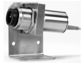
Sirius Mounting Bracket HA11

Scope of supply: Sensor with lens, 2 mounting nuts M40 x 1.5 and Manual. Connecting cable with Software has to be ordered separately