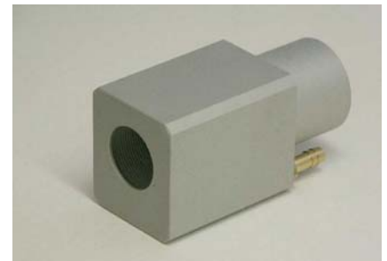
Sirius Cooling Housing KG60

Scope of supply: Sensor with lens, 2 mounting nuts M40 x 1.5 and Manual. Connecting cable with Software has to be ordered separately