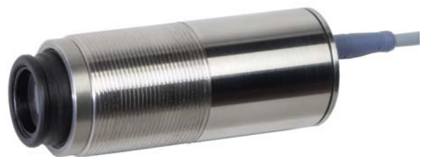
Polaris -Infrared Switch in stainless steel housing