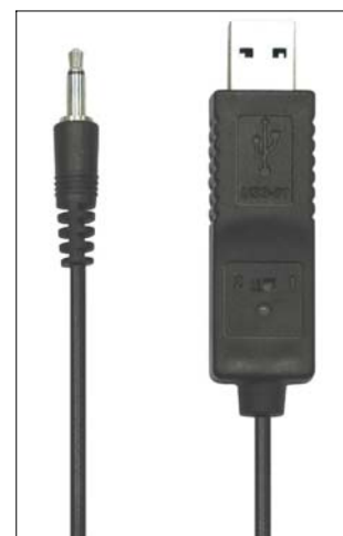
USB cable, USB-01